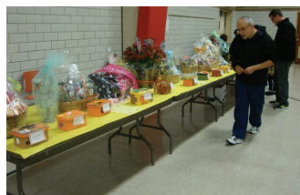
Parents contemplating raffle ticket placement for the winning basket.

The 2013-14 school year welcomed five new students: Faith